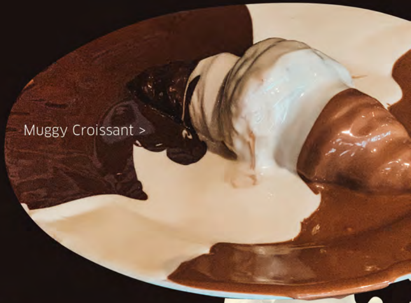
Muggy Croissant >