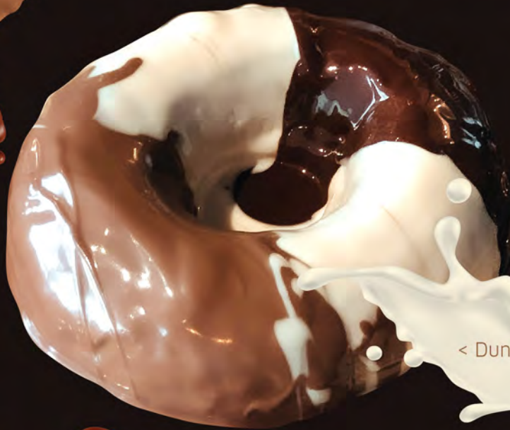
< Dunked Donut