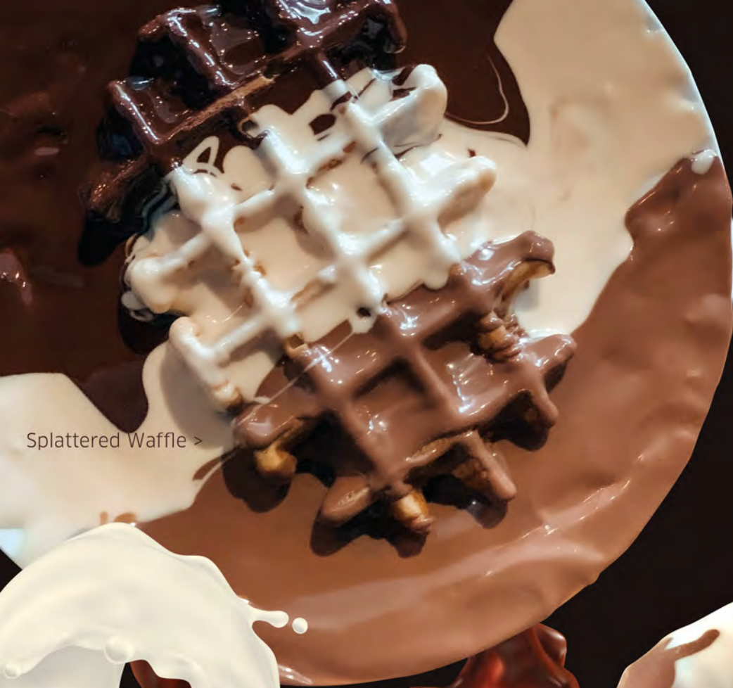
Splattered Waffle >