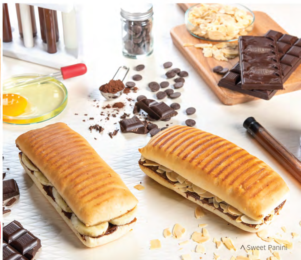
^ Sweet Panini