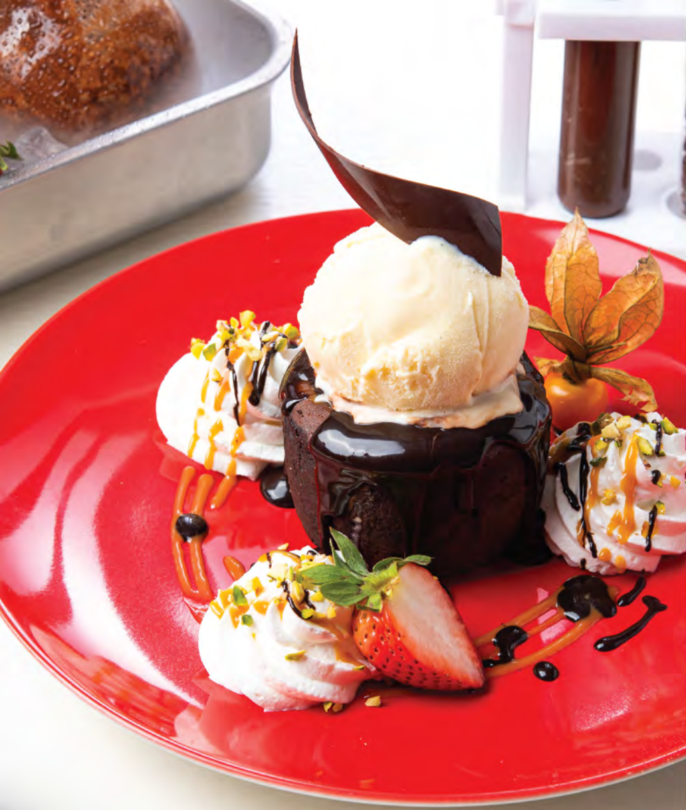
^ Chocolate Lava Cake