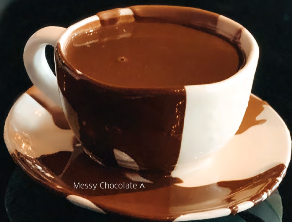
Messy Chocolate ^