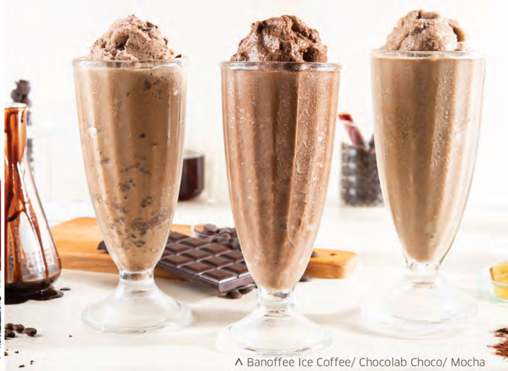
^ Banoffee Ice Coffee/ Chocolab Choco/ Mocha