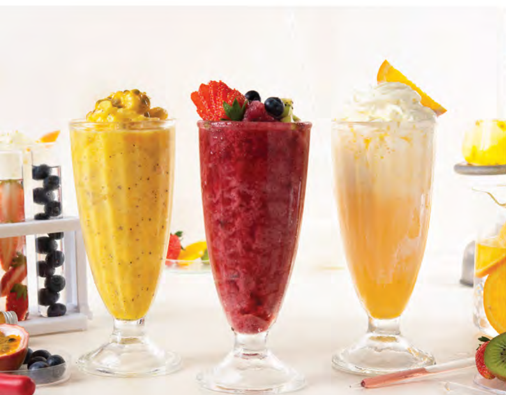
^ Passion Fruit/ Mixed Berry/ Creamsicle

Allow us to fulfil your needs -please let one of our ambassadors know if you have any special dietary requirements, food allergies or food intolerances.