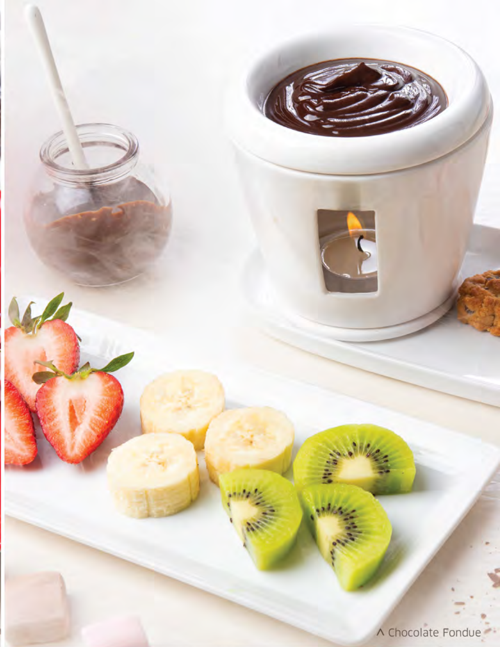
^ Chocolate Fondue