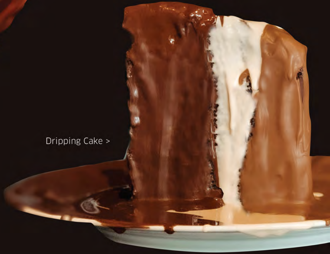
Dripping Cake >

Choco Splash available on Friday from 17.00-19.00 hrs. | Saturday & Sunday from 11.00-19.00 hrs.