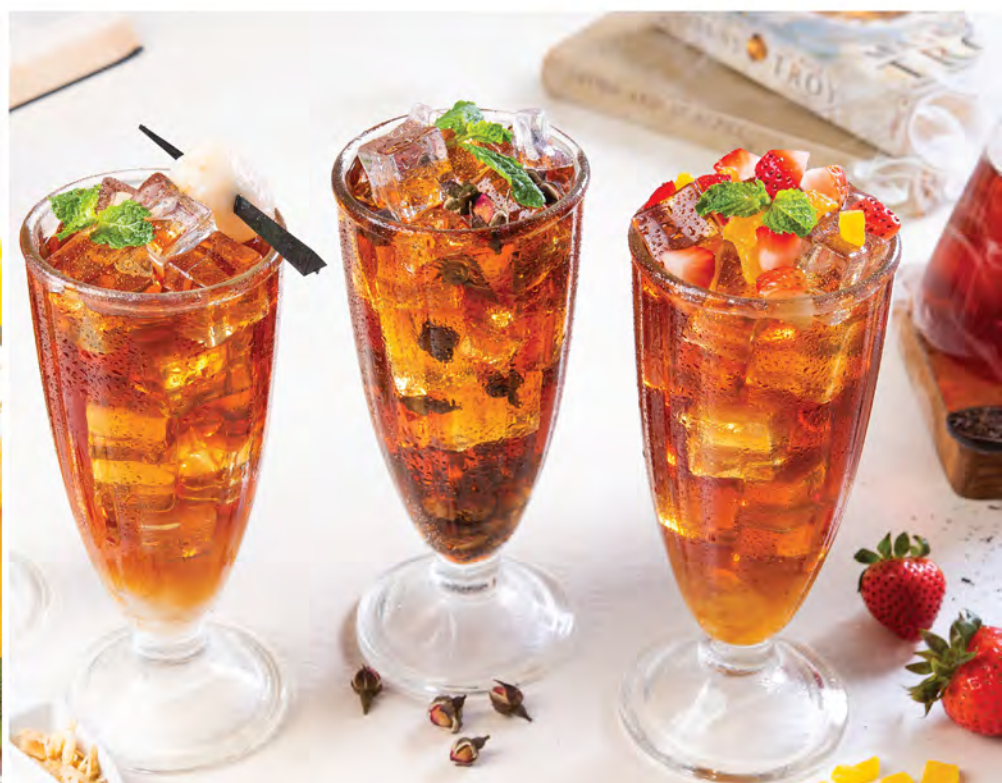
^ Lychee Almond/ French Vanilla & Rose/ Mango Strawberry