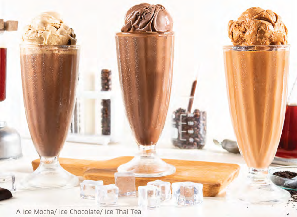
^ Ice Mocha/ Ice Chocolate/ Ice Thai Tea