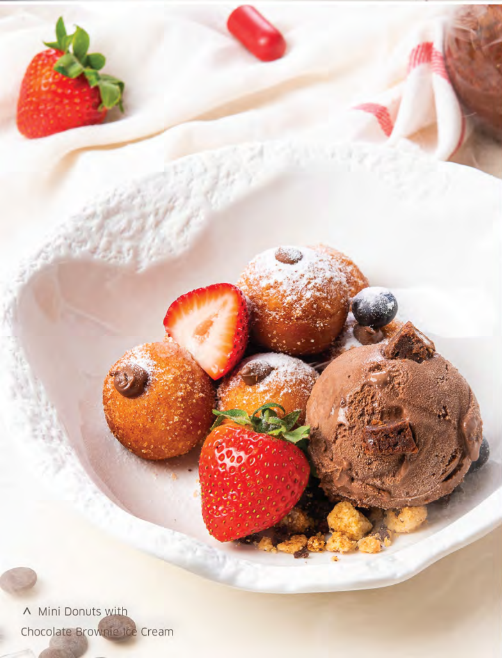
^ Mini Donuts with Chocolate Brownie Ice Cream